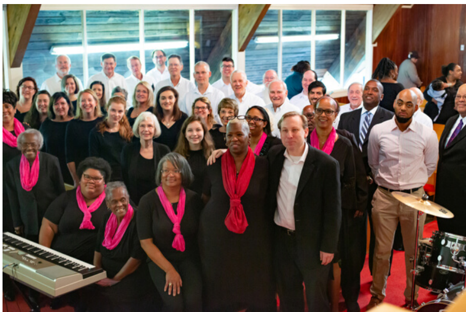
With the Zion Union Baptist Church Choir, October 2019

Every year, TOSVA sings at the Charlottesville Municipal Band's Holiday Concert, and invites local school choral groups to perform at its Christmas at the Paramount concerts. Recent collaborations have also included the Zion Union Baptist Church choir, Charlottesville Opera and the UVA University Singers .